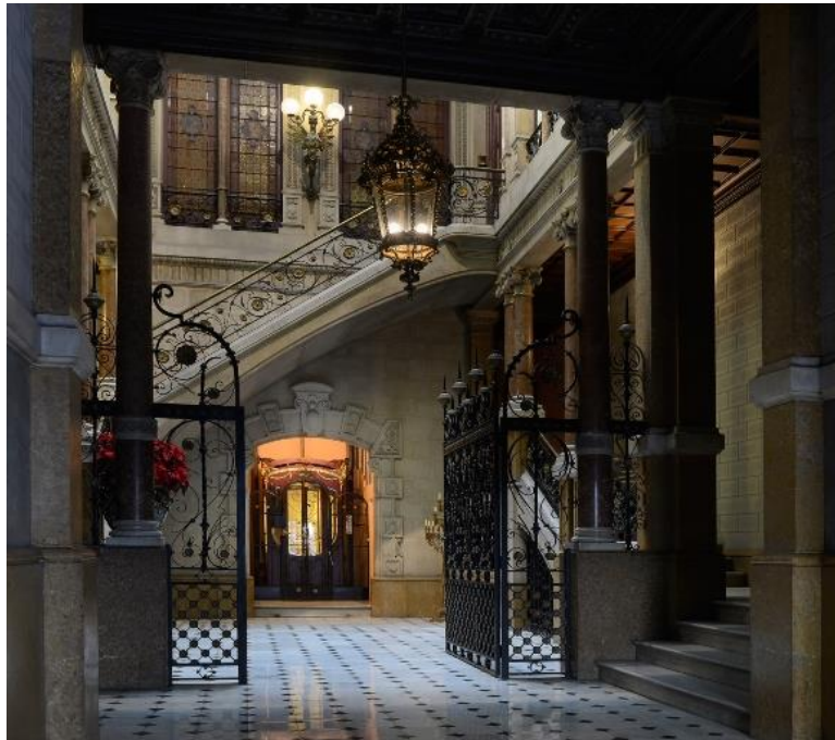
BuildingsSpain, entrance Barcelona office